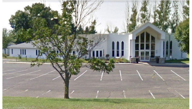
Rice Lake Bible Chapel

Everyone in attendance is invited to join us for lunch following the presentations.